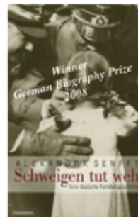
Schweigen tut weh. Eine deutsche Familiengeschichte translation: Silence is painful. A German Family History