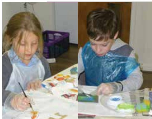
Above: Painting the Challah cloths