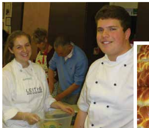
Far right: Finished challot