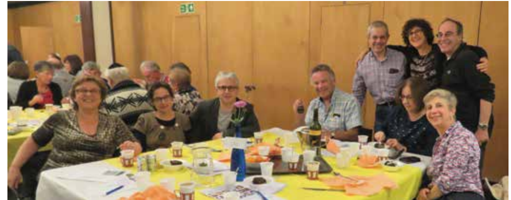
Above: Quiz Night – The winning team from HEMS