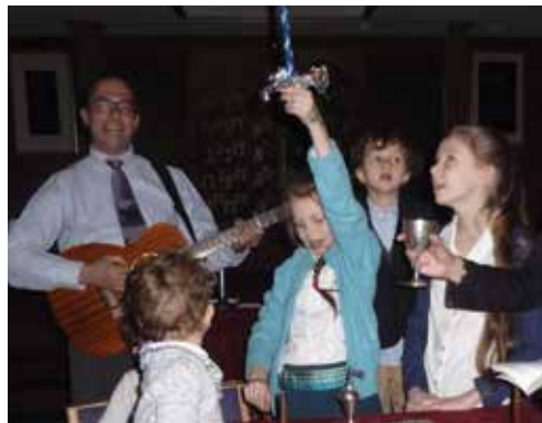
Left: Harvdalah after Mosaic Shabbat activities