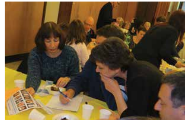
Left: Quiz night – another team