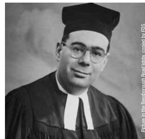
Rabbi Lionel Blue when he was first minister at MNS

Lionel first started with us when we held services at the Congregational Church at Preston Road and quite a substantial cheder at a private school in Wembley, before moving into our present premises in Harrow. He was inspirational, eccentric and loveable and taught us to challenge our beliefs, ask questions and then to work them out for ourselves. As a sermoniser, he was unique, always talking without notes and never sending his congregation to sleep. I remember his last High Holiday service with us when he proudly presented me with a script which he immediately destroyed and then gave a memorable address by analysing line by line Pete Seeger's song of