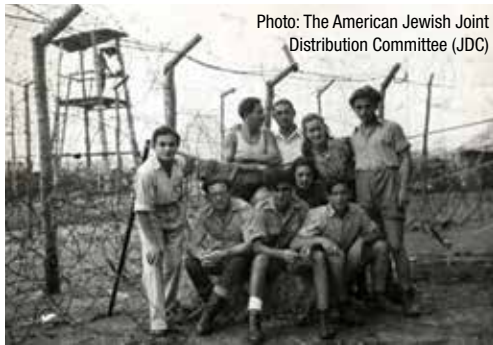
Watchtower over the Cyprus internment camps

In 1939, the British Government decided that Jewish immigration to Palestine would be limited to 75,000 over five years. Any additional émigrés would need Arab consent. At the end of the war, the British agreed to issue only 1,500 certificates of entry each month. However there were many illegal immigrants (a number trying to arrive by boat) and from August 1946 these were sent to the camps set up in Cyprus. (Out of interest, there were also two other camps – one in Mauritius and the other at Atlit near Haifa)