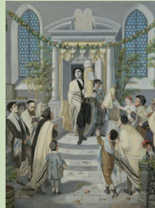
Shavuot by Moritz Daniel Oppenheim

We will be celebrating Shavuot from Tuesday 30 th May until Thursday 1 st June