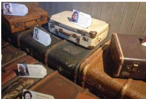
Above: Suitcases used to come to England – donated by Kindertransport children.

We were taken from room to room with audio-visual examples that showed the build-up of Nazism that led to Leo being sent