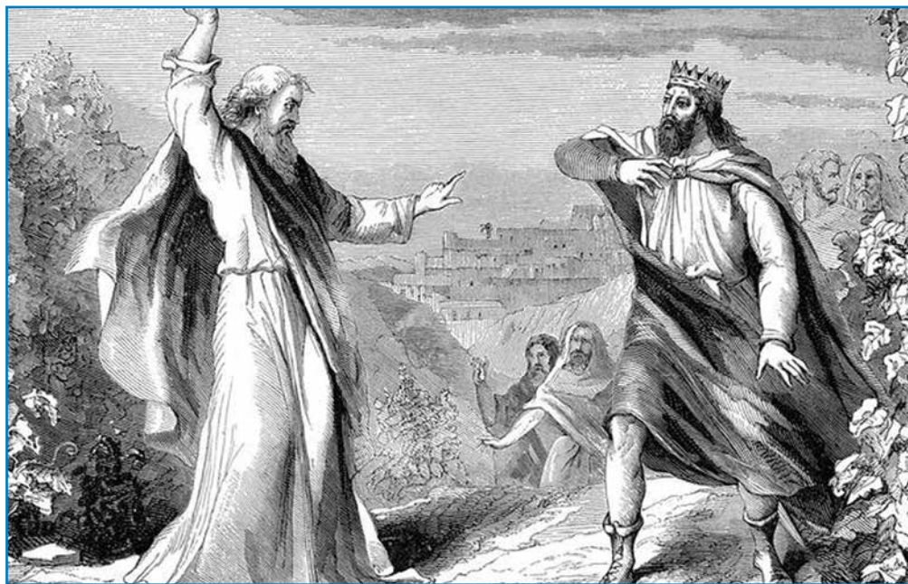
Elijah denouncing King Ahab