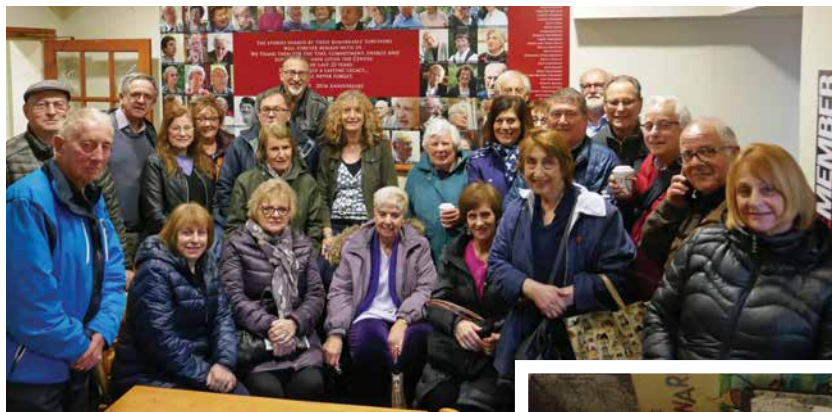
Left: (Most of) the Mosaic group at the museum.

(A visit to National Holocaust Centre continued from p7)