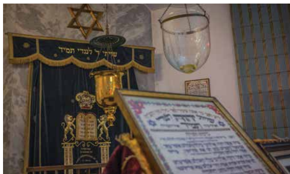
Above (top) Our group and the menorah with its delightful inscription.