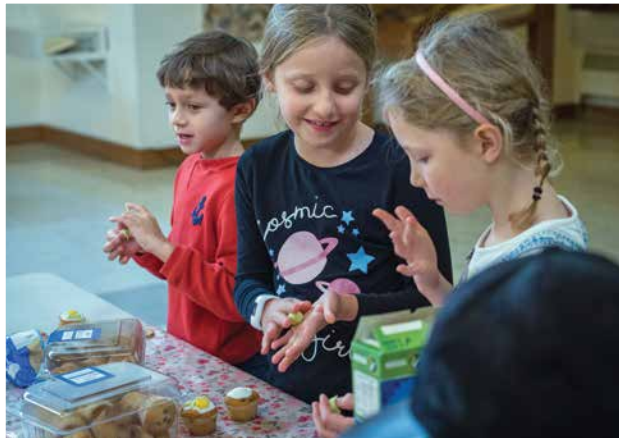
HaMakom prepare the succah decorations