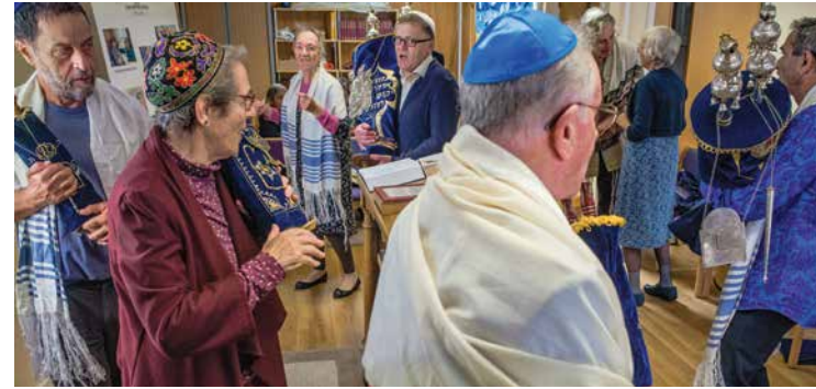
Simchat Torah at Mosaic Liberal