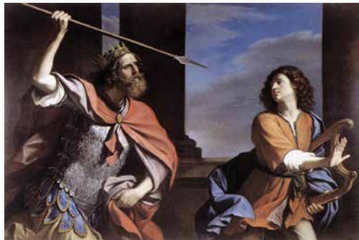
Saul and David by Guercino